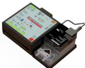
• Figure 1: Physical Dimensions